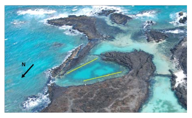
Figure 1: Montipora pond in the 'Āhihi Kīna'u Natural Area Reserve System (NARS) Maui, Hawai'i. The pond is ~38m in maximum diameter with two 25m transects located on the east and west edges of the pond.

Benthic cover data were collected in September 2008 and January 2010 using 0.5 m<sup>2</sup> adjacent, nonoverlapping photo-quadrats along two 25 m transects. Transects were located along the east wall of the pond and at the entrance along the western edge of the pond (Fig. 1). Both transects were approximately 1.5 m in depth. Point-counts were conducted using PhotoGrid software (Bird 2001). Fifty randomly selected points were superimposed on each photograph, and the substratum directly beneath the center of the point was recorded. Data were analyzed to determine the percentage of surveyed benthos covered by coral, algae, and bare substratum. In July 2010 and March 2011, benthic cover data were collected using the point intercept methodology, in which the benthos directly under the transect line was recorded every 0.25 m.