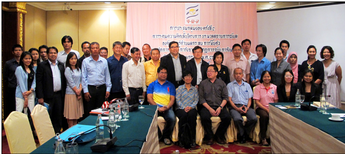
Figure 1: A meeting between coral reef scientists, managers and stakeholders concerning coral reef bleaching impacts and management

Department of National Parks, Plant and Wildlife, a network of Thai universities, For Sea Foundation, NGOs and private companies began the development of the coral reef management strategy under coral bleaching crisis in June 2010. A review of physical oceanography data, coral reef ecology, watershed ecosystem, coastal zone management and coral reef management plans in Thailand and other countries was conducted. Several meetings, seminars workshops and conferences on coral reef related issues, especially coral bleaching impacts, recovery trends and management were reviewed and analyzed (Fig. 1).