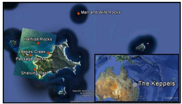
Figure 1. Map of the Keppel Islands and locations of anemone and anemonefish surveys conducted during a study of the effects of a moratorium on commercial collecting. Inset shows the location of the Keppels along the Queensland coast in Australia.

The moratorium specified that collecting was suspended at Passage Rocks, Man and Wife Rocks and Halftide Rocks (Fig. 1). The two other sites in the study were Shelving Reef, which is a Marine Park Public Appreciation area where no collecting occurs, and Leeke's Creek where collecting of species other than A. melanopus and E. quadricolour is permitted and where collecting was not suspended throughout the moratorium (although no data on collection was available).