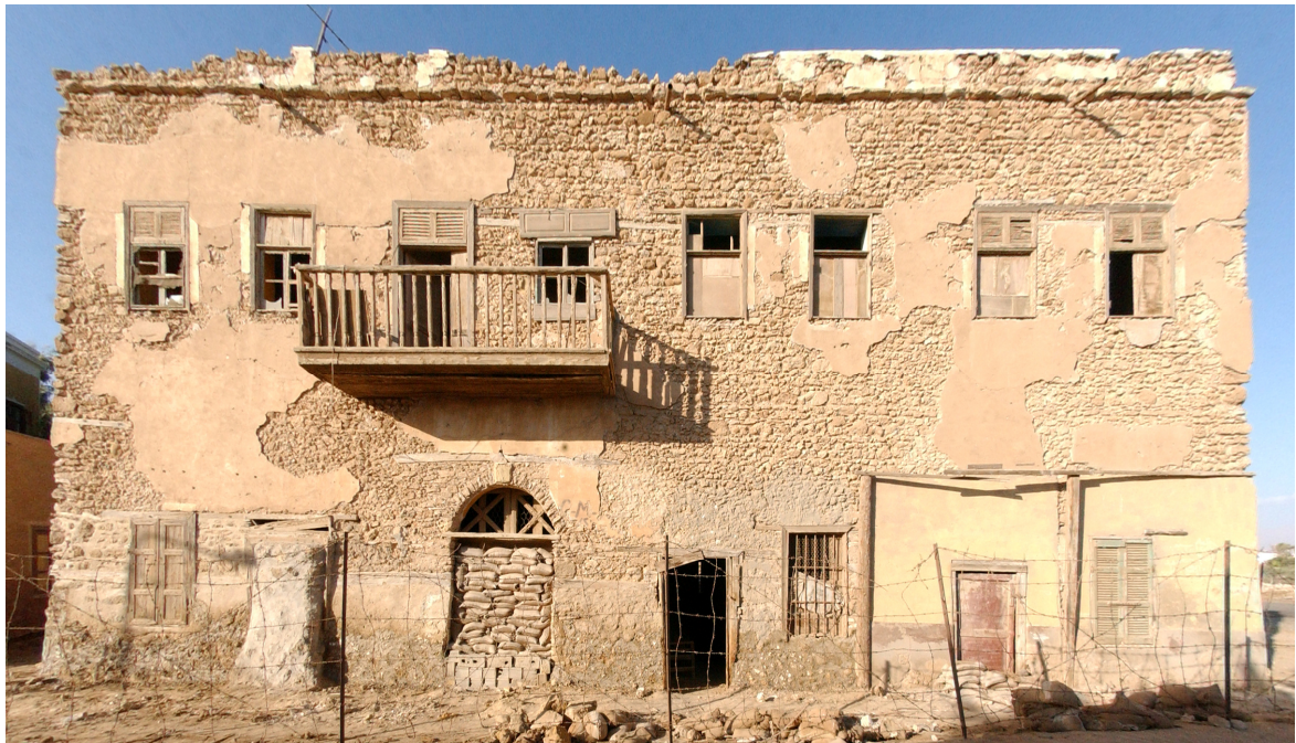
Figure 1: House No. 33 at al-Tur, south elevation